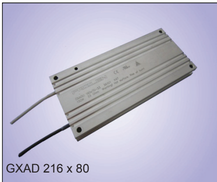
GXAD 216 x 80

100 – 1125 W, IP 40, profile x80 and x120